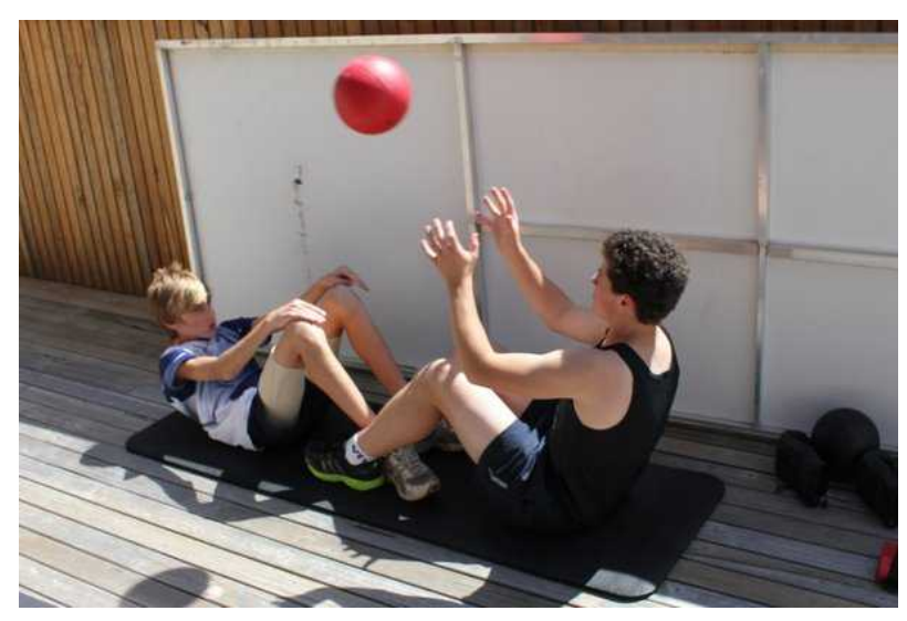
Working hard in the gym