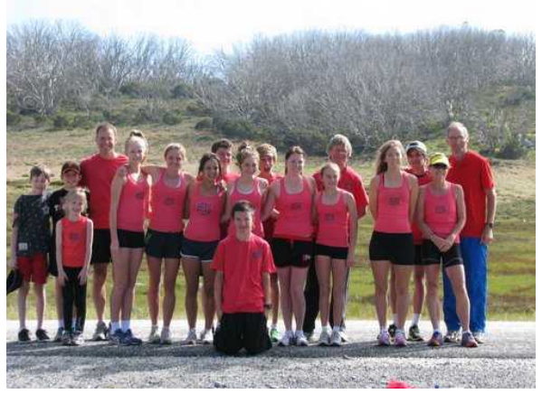
Left: Ready for some speed work