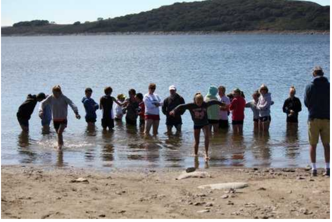
Left: Out for a hike