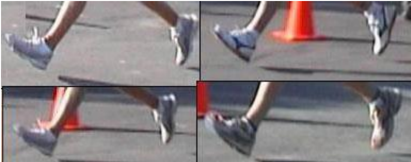
Figure 3: Loss of Contact – both feet off the ground at the same time. The rear leg has left the ground, before the advancing leg has made contact with the ground.