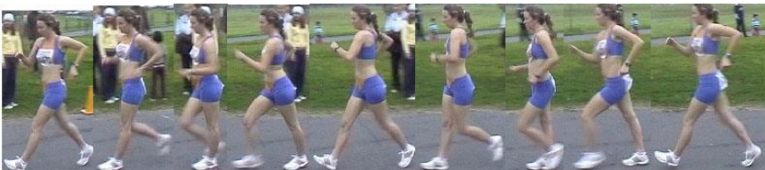
(Fig 6): The Race Walker is demonstrating sound Race Walking technique, the front foot strikes the ground, preferably on the heel, before the back leg leaves the ground. The leg is straightened on contact with the ground until it is in the upright position.

The pictures below demonstrate the Correct Race Walking Style with a straightened leg on contact and part of the foot in contact with the ground at all times.