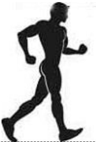
Figure 1: Contact

The WA Rule 54 (230) draws attention to the two vital phases in every Race Walking stride we term simply as 'Contact' and 'Knees'