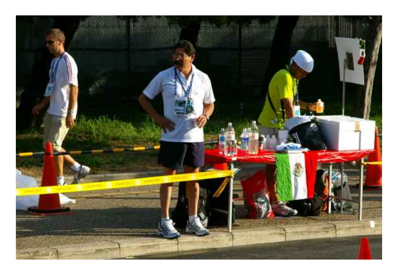
2007 at the IAAF World Champs in Osaka at the Mexican feed station in the 50km event