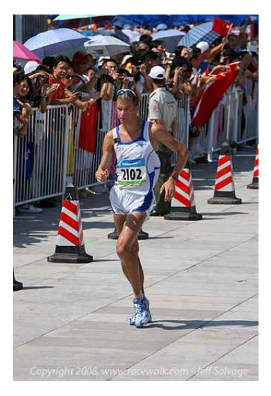
Schwazer on his way to Olympic 50km gold in Beijing in 2008

With Italian Olympic 50km champion Alex Schwazer in such great early season form (20km win in Lugano in 1:17:30 followed a week later by 50km win in Dudince in 3:40:58), it is timely that the European Athletics website has published the following interview with him – see <a href="http://www.european-athletics.org/youth-athletics-programme-news/362-meetings-2011/race-walking-permit-meetings/10896-italys-schwazer-back-on-track-to-defend-olympic-50km-walk-title.html">http://www.european-athletics.org/youth-athletics-programme-news/362-meetings-2011/race-walking-permit-meetings/10896-italys-schwazer-back-on-track-to-defend-olympic-50km-walk-title.html</a>