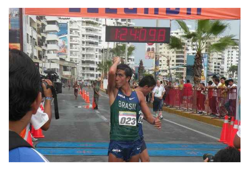
Caio Bonfim winning the South American 20km Race Walk title in Salinas