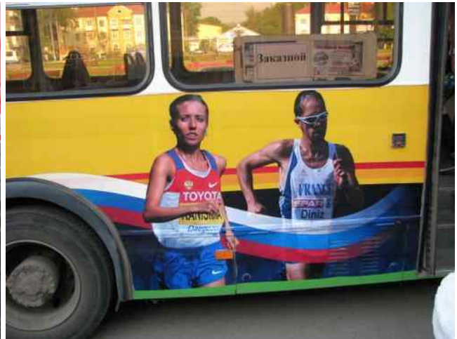
Left: finally arriving in Saransk after about 40 hours of travel Right: Plenty of billboard advertising for what is a major event for this Russian city