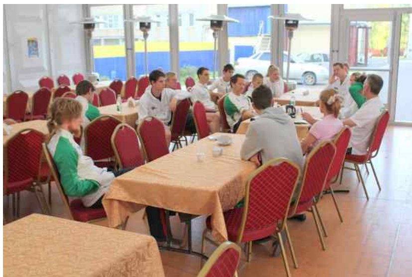
Team meeting Monday evening