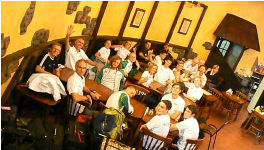
Dinner in Moscow before the final leg to Saransk