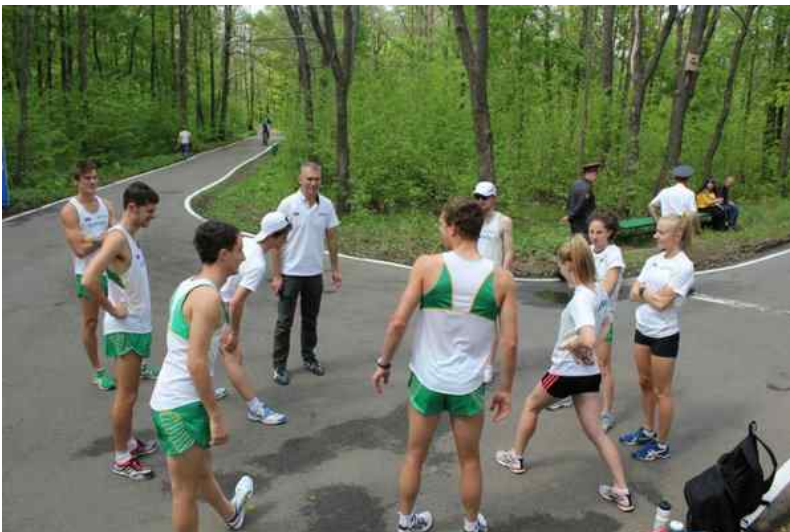
Left: Warming up on Monday afternoon before the first session in Saransk