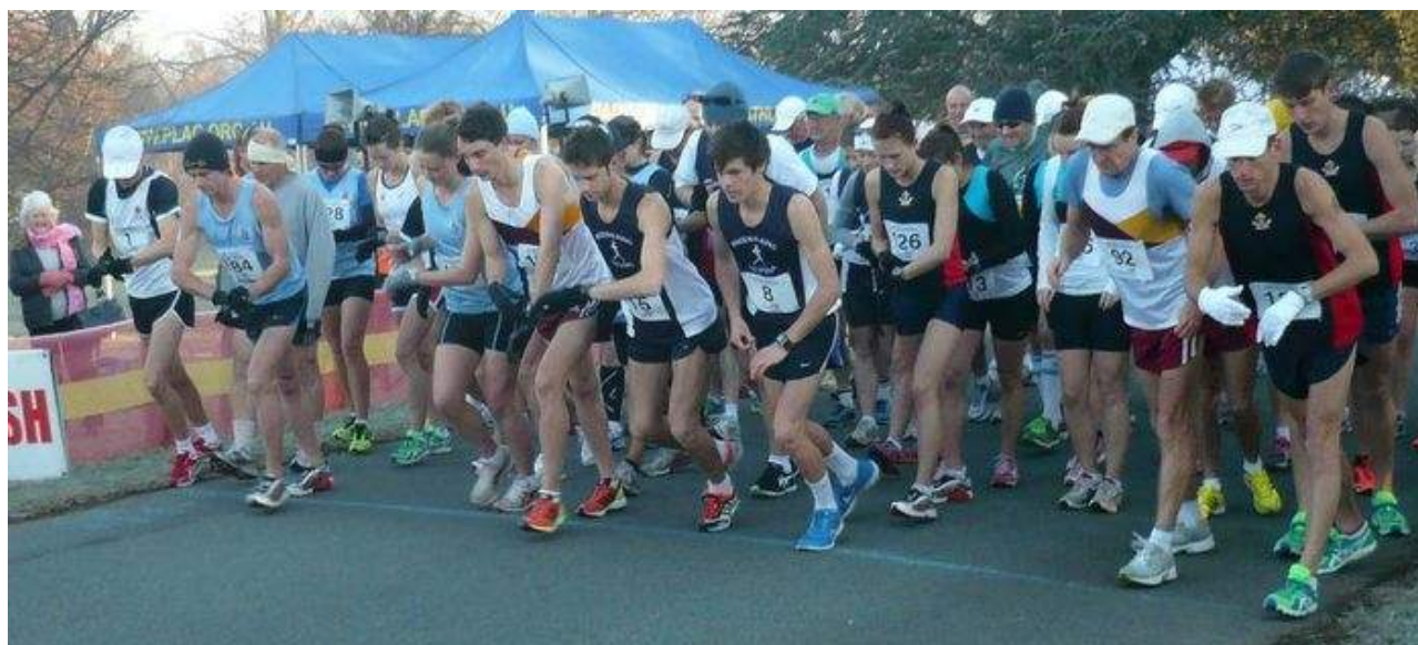
The start of the 10 Mile and 20 Mile events on Sunday morning

Finally, club photographer Terry Swan was busy over the long day with camera and has uploaded a selection of photos to our VRWC Photo Gallery at http://www.vrwc.org.au/coppermine . I still have to upload my selection but here is a brief overview of some of our many wonderful walkers on display.