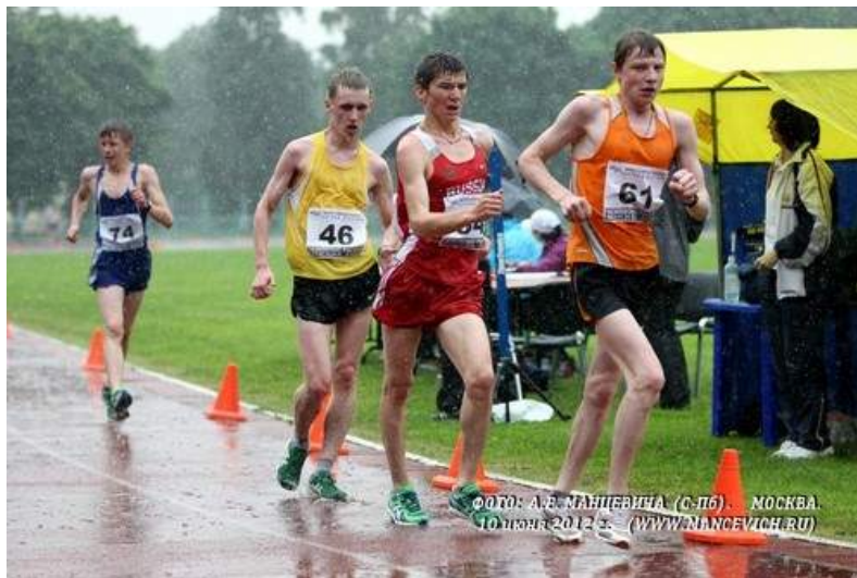
Wet for the junior walks in Moscow