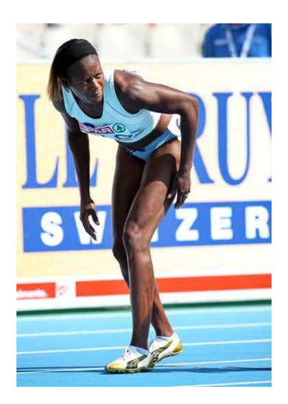
Ottey runs in the Slovenian colours

In addition to various records for longevity, the Jamaican-born athletics legend's achievements include having competed at a record seven Olympic Games and winning nine medals. Ottey, who claimed her first Olympic medal at the Moscow Games in 1980, knows Helsinki's Olympic stadium well after having won a 200m silver medal there at the inaugural IAAF World Championships in 1983. You can check out her amazing record at http://www.iaaf.org/athletes/biographies/letter=o/country=slo/athcode=61432/index.html.