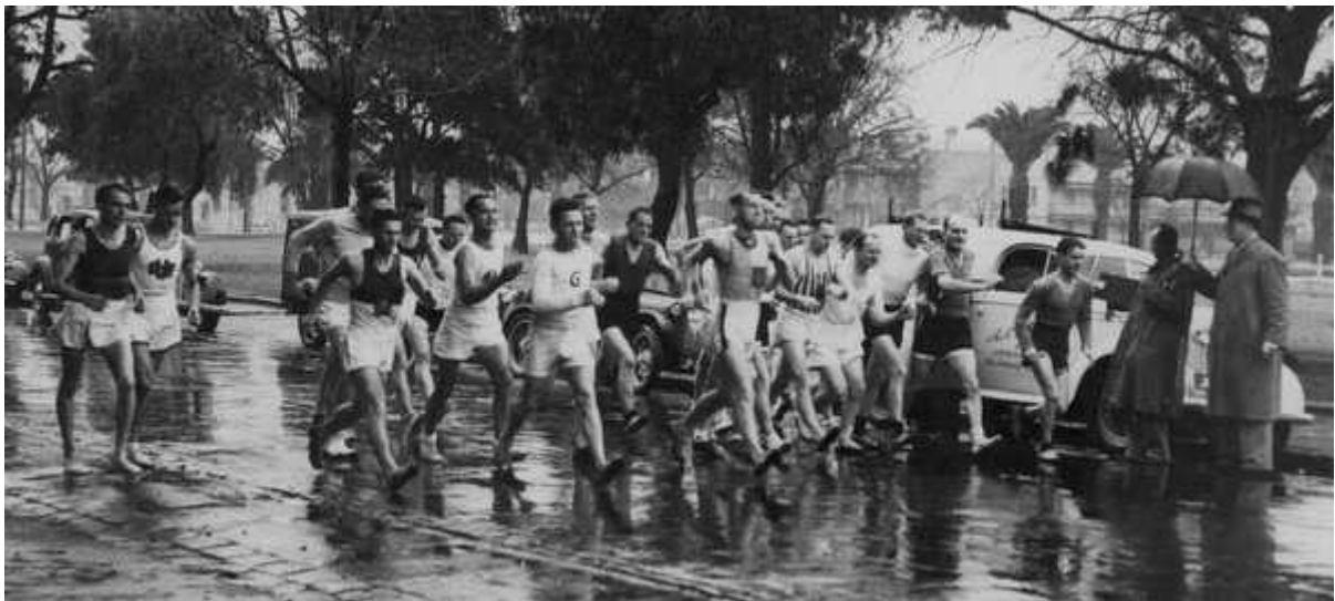
1947 – VAWC Club Race at Albert Park – walking towards MacRobertson's High School – just like in the poem

Then suddenly I noticed both ranks were fading out And very soon that day in June there were no wrigglies about. And I am left to ponder as I complete this recitation Did I really see them wander or was it just hallucination.