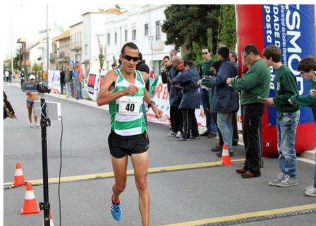
Lashmanova and Vieira win in Rio Maior

There were also 2km roadwalks in which 66 competitors participated. See the full results at http://omarchador.blogspot.pt/2013/04/rio-maior-resultados-da-marcha-jovem-de.html