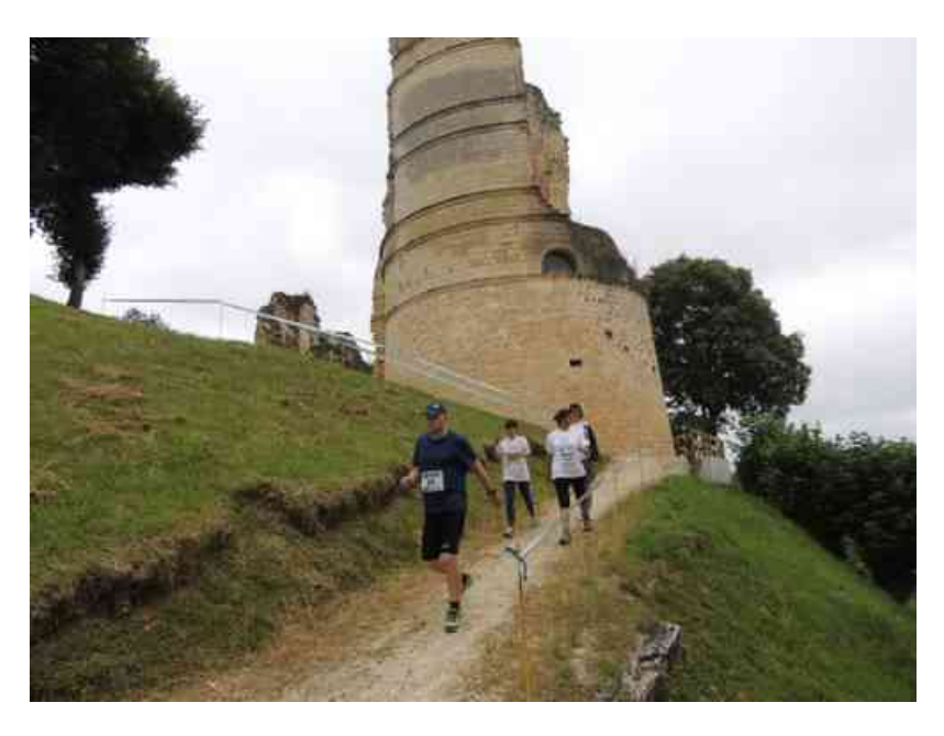
Part of the course at Montguyon - not your typical flat fast lap!

Check the website for the full results and for plenty of photos: <a href="http://asso.lempreinte.free.fr/index.php?page=classements-3">http://asso.lempreinte.free.fr/index.php?page=classements-3</a>. Check out this photo!