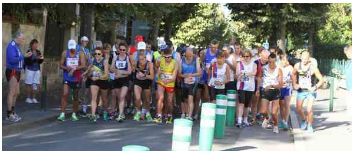
The start of the 20km championships - 64 walkers in all