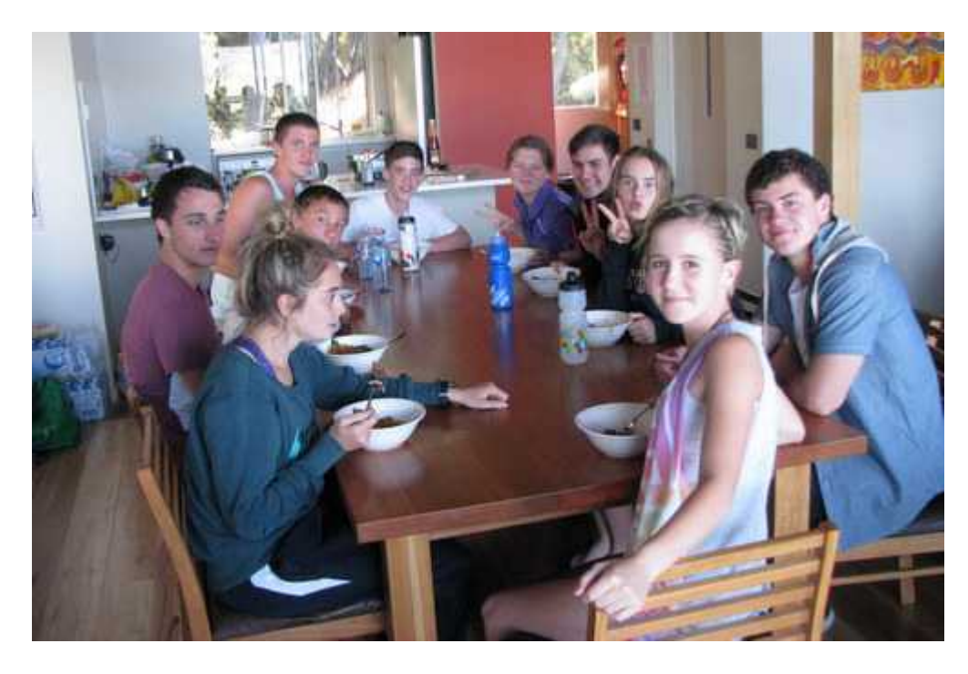
Hungry after another big day