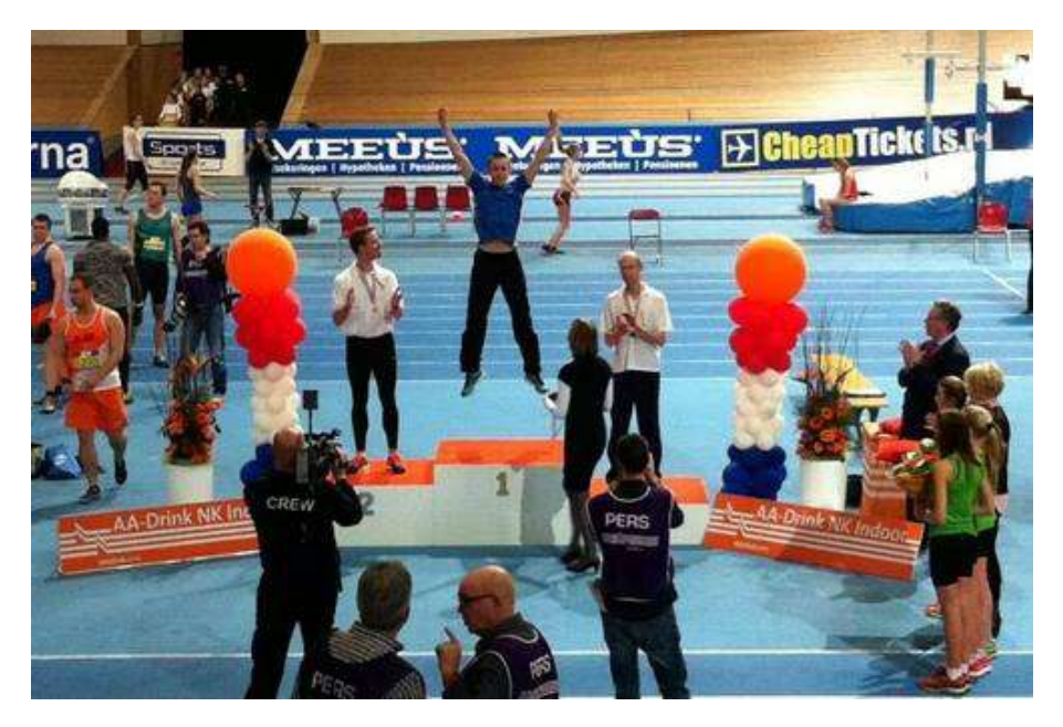
Men's podium at the Dutch indoor champs