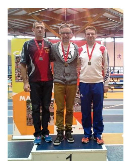
W50 and M40 medallists at the French Masters Champs in Eaubonne