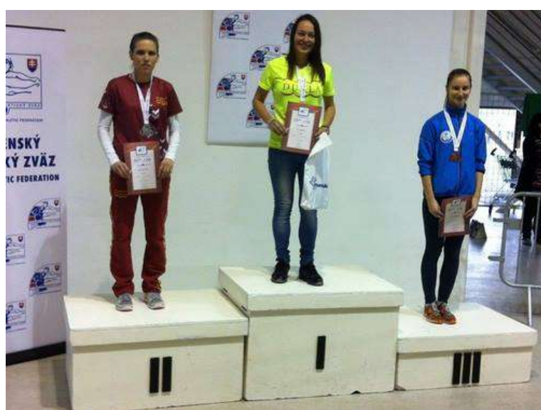
Men's and Women's podiums at the Slovakian indoor champs