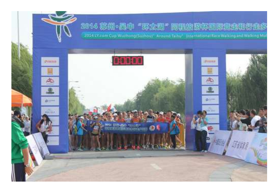
The walkers line up for the start