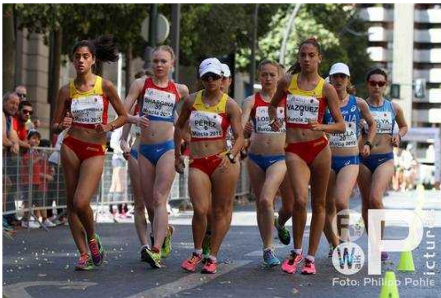
The Spanish girls lead out in the Junior Women's 10km