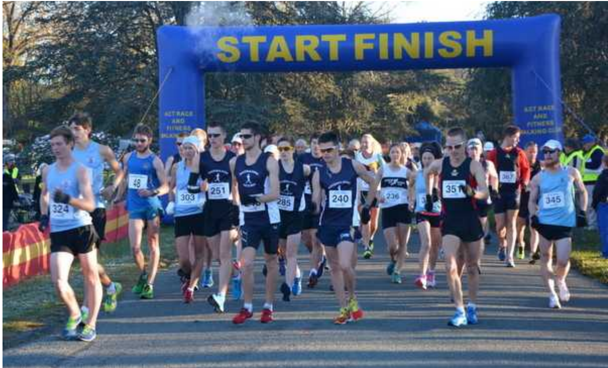
The start of the 2014 LBG 20 Miles and 10 Miles walks

The 20 Mile event is as challenging event as you can get but it regularly attracts between 30 and 50 walkers each year. The tough hilly course challenges the walkers, both international and club standard, and the cream of Australia's walkers have strived to win this prestigious event year after year. Indeed it is one of the most highly sought prizes in the Australian racewalking calendar.