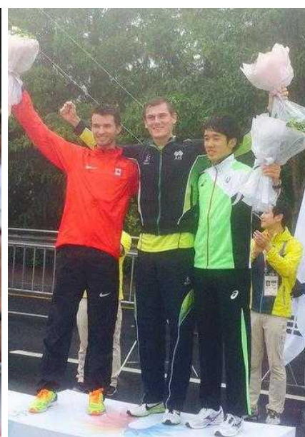
Top spot on the podium