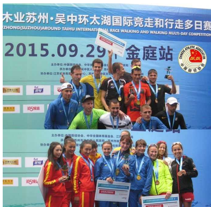
The first 3 teams in each division won US$20,000, US$15,000 and US$10,000 respectively – a good 4 day's work

The top 8 in the men's and women's team events are shown below. While there were no major changes in the men's standings, Ukraine came from behind to overtake the Chinese and win the women's teams category.