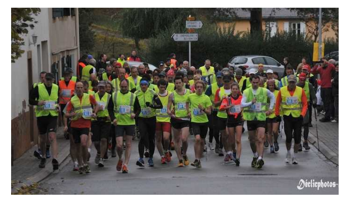
The start of the race