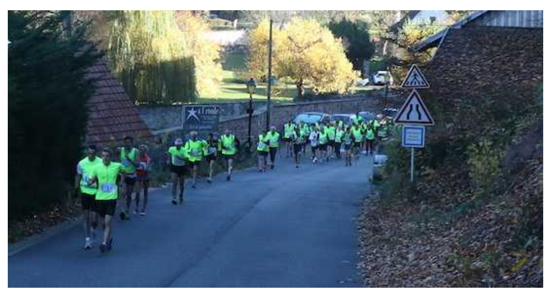
The field is already well spread 400m into the climb