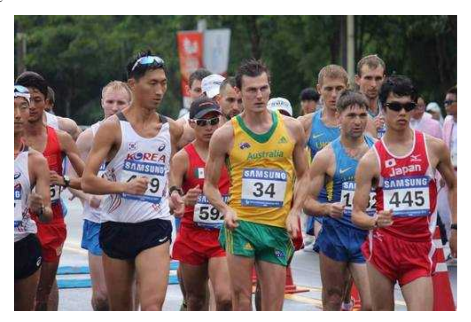
Dane walks to gold in the 2015 World Universiade 20km in Gwanju

Dane's 2015 year started with a hiccup when he was a last minute withdrawal from the Australian Summer 20km Championship in Adelaide, the victim of a heavy cold. But it was only a temporary setback as he was back a month later to win the Australian 10,000m Track Championship in Brisbane with 39:53.89. Then it was off to Taicang for their leg of the IAAF Challenge Series and he showed his form with 5<sup>th</sup> in 1:22:12. He walked even better the following month in La Coruna, finishing 5<sup>th</sup> in a PB 1:20:05. This was followed a month later by a win in the World Universiade 20km in Gwanju, South Korea. In a desperate sprint finish with Canada's Ben Thorne, Dane won out by the narrowest of margins in a time of 1:21:30. Then it was onto Beijing for the IAAF World Championships 20km where he finished 8<sup>th</sup> in 1:21:37. Then it was back to the Lake Taihu 4 Day Rally where he finished 2<sup>nd</sup> to Ding Chen again with daily finishes of 4<sup>th</sup>, 1<sup>st</sup>, 3<sup>rd</sup> and 1<sup>st</sup>. 2015 had definitely been his best year ever and he was now a regular top finisher on the world stage.