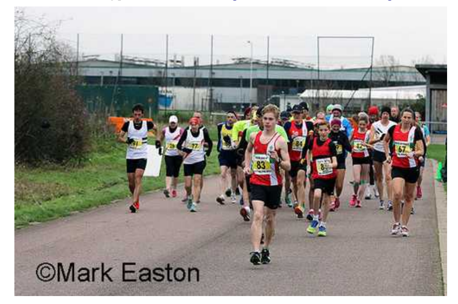
The start of the Hillingdon 10km

Thanks to Mark Easton for the following photos. Lots more at http://markeaston.zenfolio.com/p551337742.