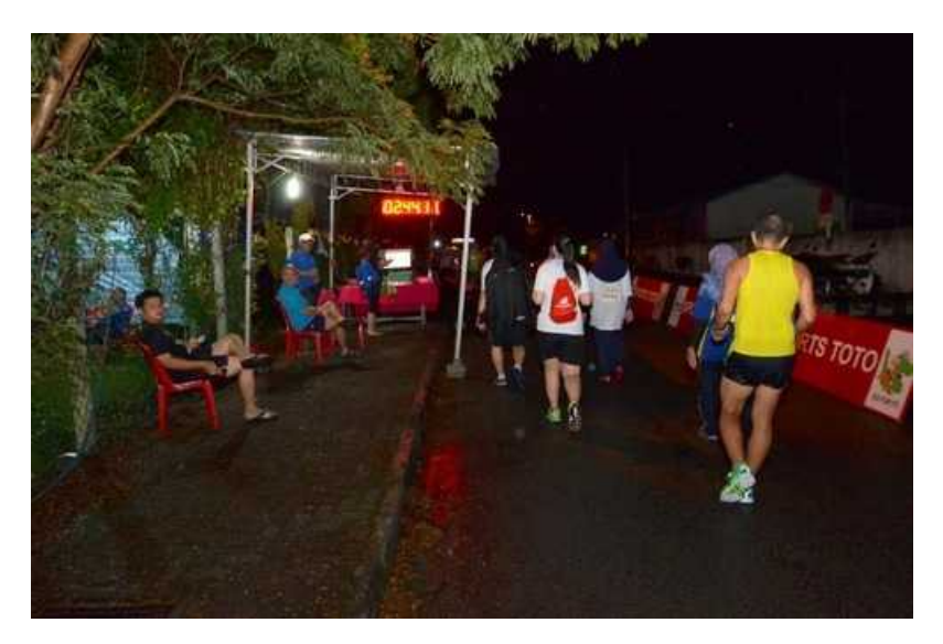
Walkers in action in Kajang