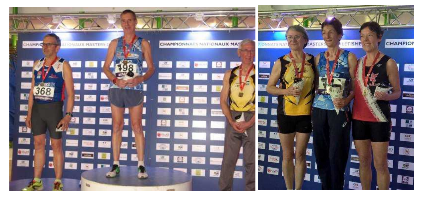
Podiums - M65 Men and W60 Women