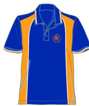
The LBG 50 th Memorabilia -on sale now!