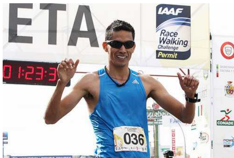
20km winner Horacio Nava