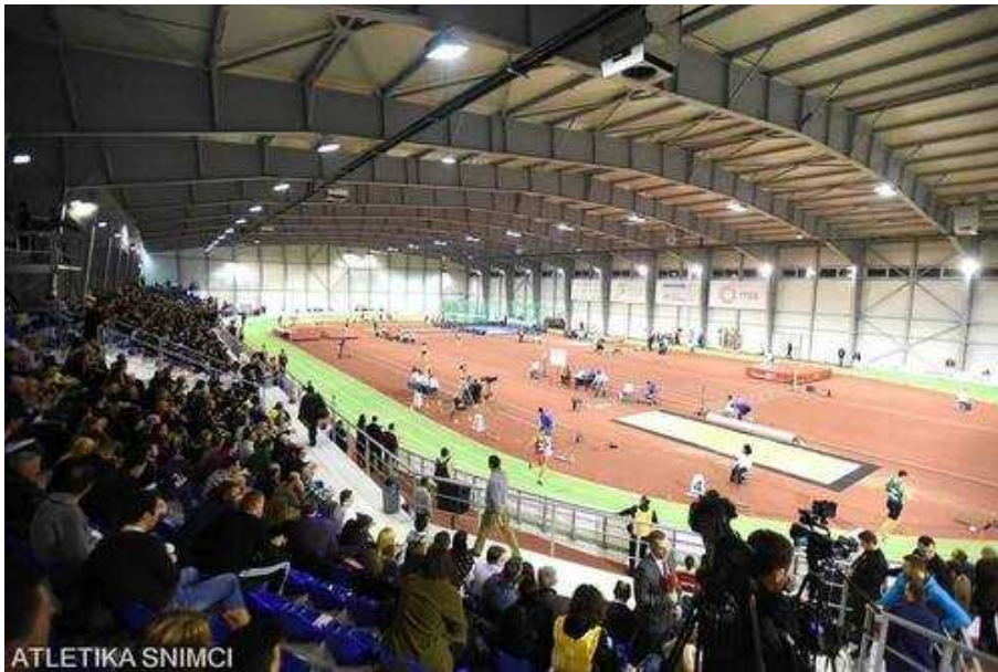
The new indoor sports hall in Belgrade, Serbia