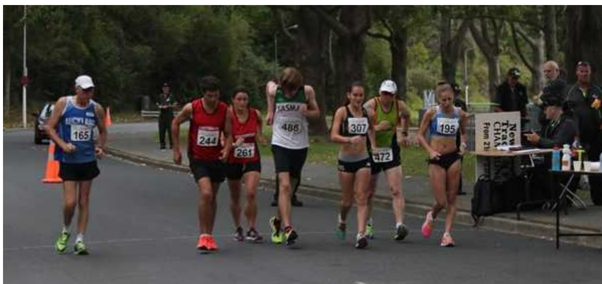
Walkers get underway on Sunday morning in the roadwalk at the NZ T&F champs in Dunedin