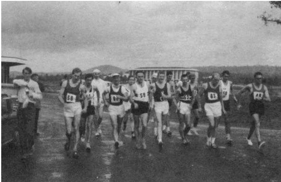
The start of the inaugural LBG 20 Mile walk in 1967

ACTRWC are keen to make this 50 th LBG Carnival something to remember. Apart from inviting all those old time walkers to return for a special once off celebration, arrangements have been made to provide some commemorative merchandise, namely, Beanies, T Shirts and Polo Shirts. The beanies are already available but the T/Shirts and Polo Shirts will be available by pre order only. The costs are very reasonable for what is sure to become a collector's item.