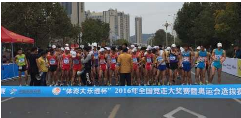
Start of men's 20km in Huangshan