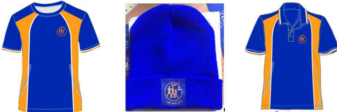
The LBG 50 th Memorabilia -on sale now!

Further info, along with an order form, are available for viewing at http://www.actwalkers.com.au/lbg-50th-anniversary-commemorative-merchandise/ . Note orders must be placed by 31 st March so download the entry form and action it.