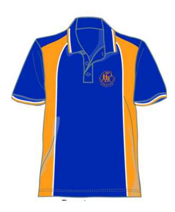
The LBG 50th Memorabilia -on sale now!