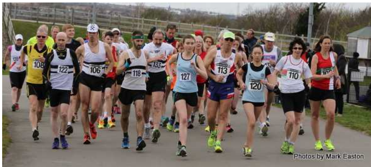
The events get underway – what a great field!