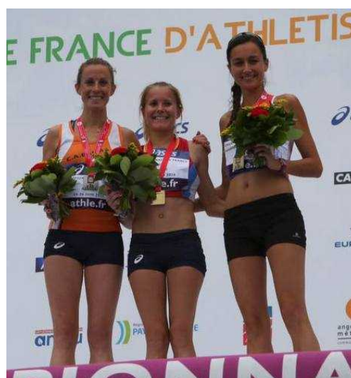
The women's field and podium