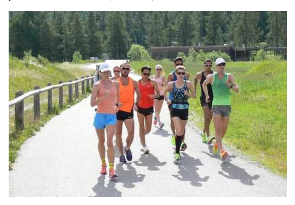
And off they go again!