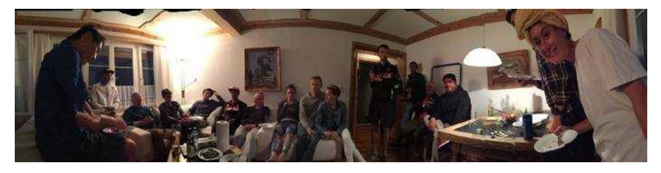
You can't train all the time!