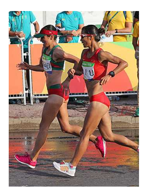
The final 5 before the fireworks erupted and then it was a final two fighting out the finish

Our Australian reps all walked well and finished the race.