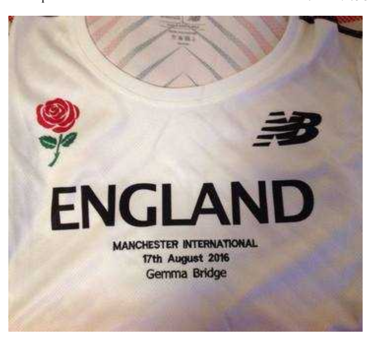
A nice touch - personalised English vests for the Team England representatives