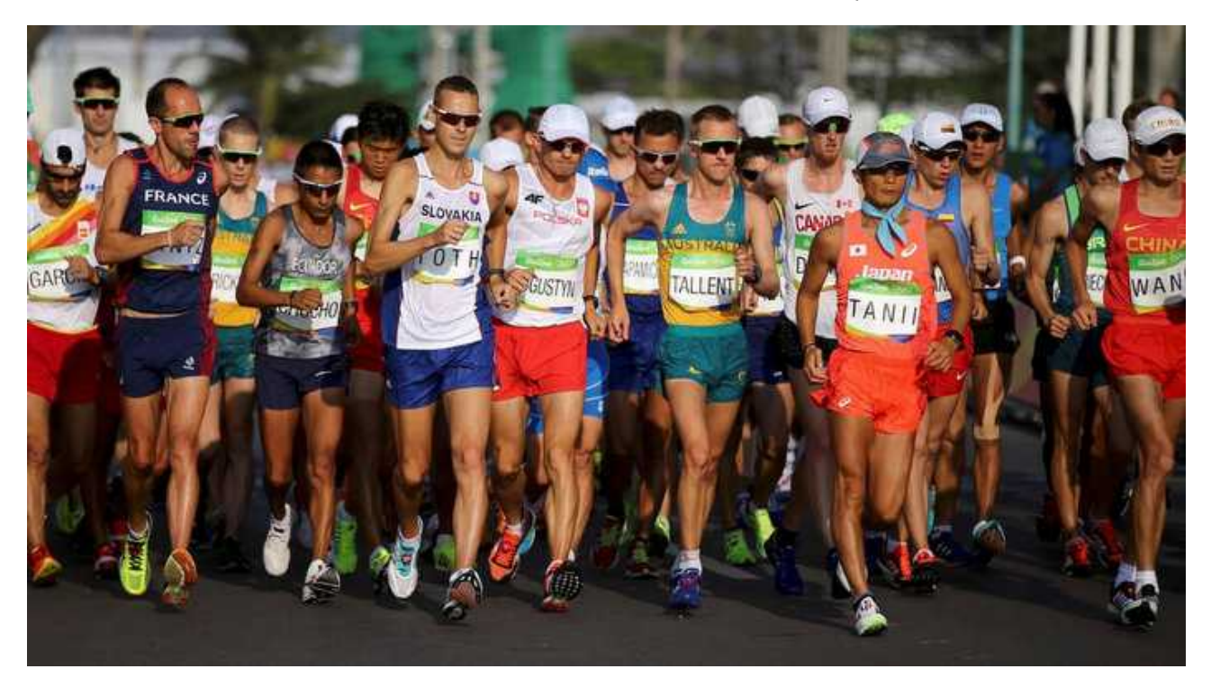
Underway for the 50km walkers, with the main players on the front line