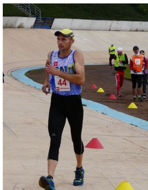
Left: Negotiating the thin cement velodrome strip to avoid the muddy interior Right: up the incline to leave the velodrome interior