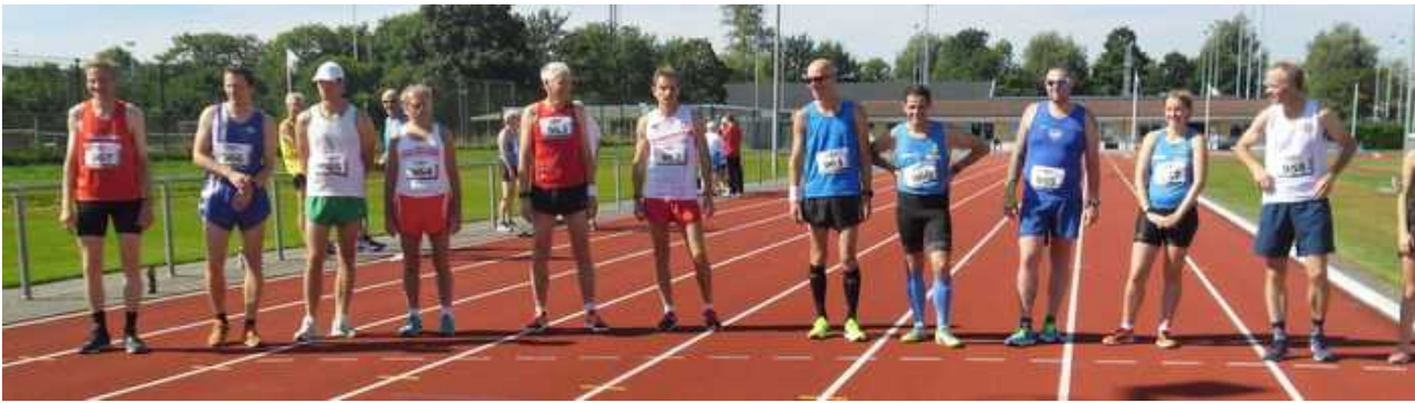
Start of the 1 Mile walk heat 1