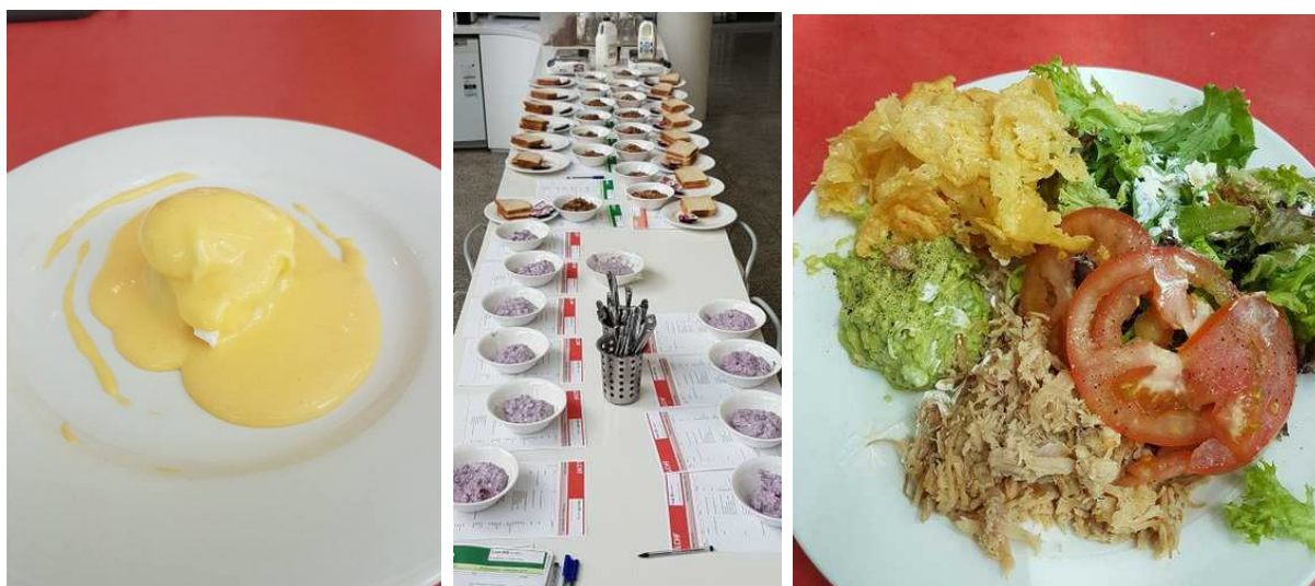
weighed to the gram, with micro- and macro-nutrients precisely calculated for each athlete

differently, and international stars Evan Dunfee and Brigita Virbalyte have still pumped out some impressive workouts. But, like in Supernova 1, the LCHF have dropped off the high-carb group to the tune of about 7%.