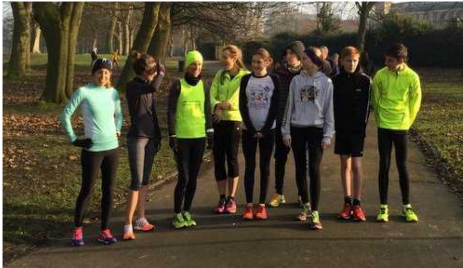
The young walkers rug up for a Wednesday morning training session