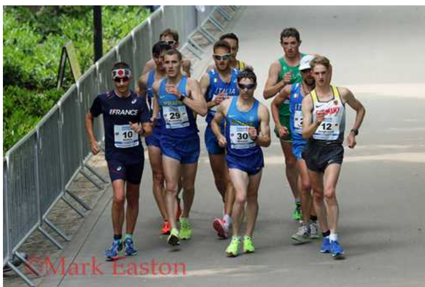
50km lead group (winner second from left in front line)