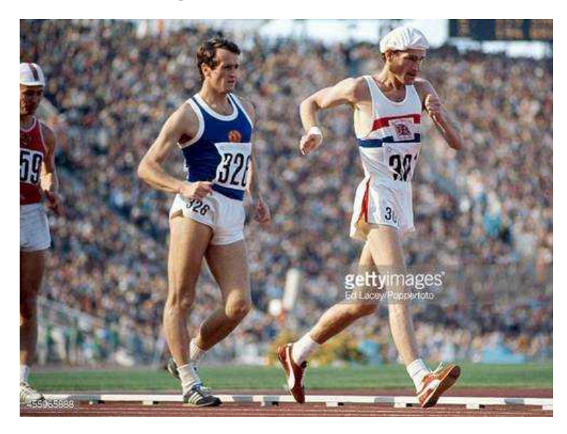
English walker Paul Nihill leads eventual winner Peter Frenkel of East Germany in the 1972 Olympic 20km

The racewalking stamp is a direct copy of a famous 1972 Olympic 20km photo showing East German Peter Frenkel (the eventual winner) and British walker Paul Nihill. Here is the photo