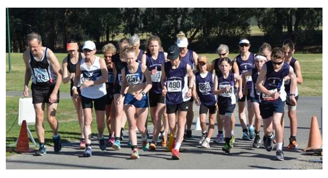
The start of the 5km and 3km walks

Photos: Terry Swan (see <a href="http://www.vrwc.org.au/piwigo/index.php?/category/446">http://www.vrwc.org.au/piwigo/index.php?/category/446</a>).