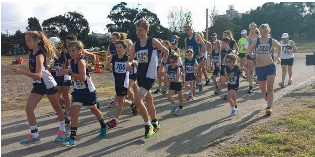
Walkers get underway at Middle Park last Saturday