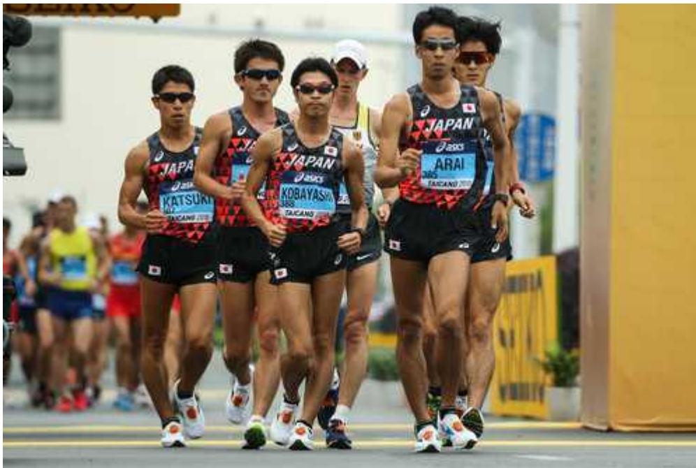
The Japanese dominate the Taicang 50km earlier this month

One thing seems certain – the Japanese walkers are going to put on one hell of a show in Tokyo 2020.