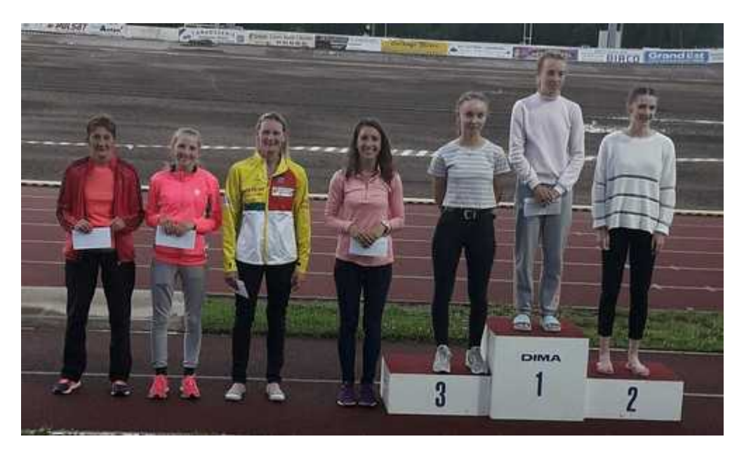
Podium at Lunaville