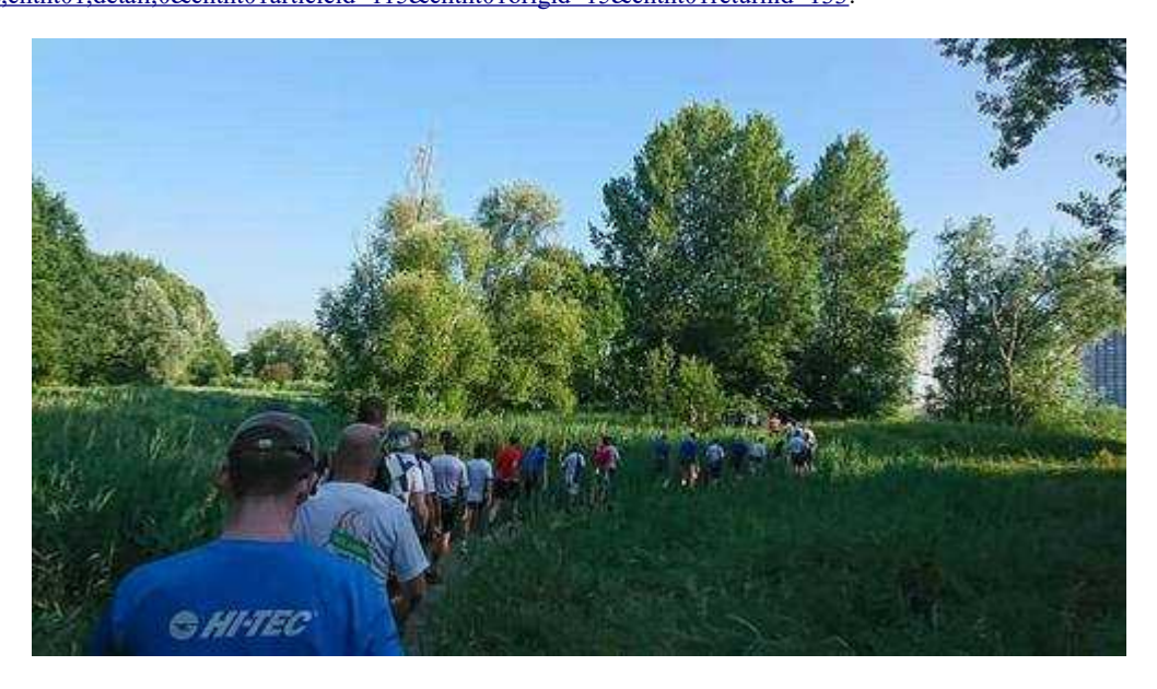
Walkers in action in the RWV 90th Anniversary walk from Vlissingen-Rotterdam

Total distance 160km. From reading the comments of the various participants, it was a great success. See the event report at <a href="http://www.rotterdamsewandelsportvereniging.nl/index.php?">http://www.rotterdamsewandelsportvereniging.nl/index.php?</a> mact=News,cntnt01,detail,0&cntnt01articleid=115&cntnt01origid=15&cntnt01returnid=133.