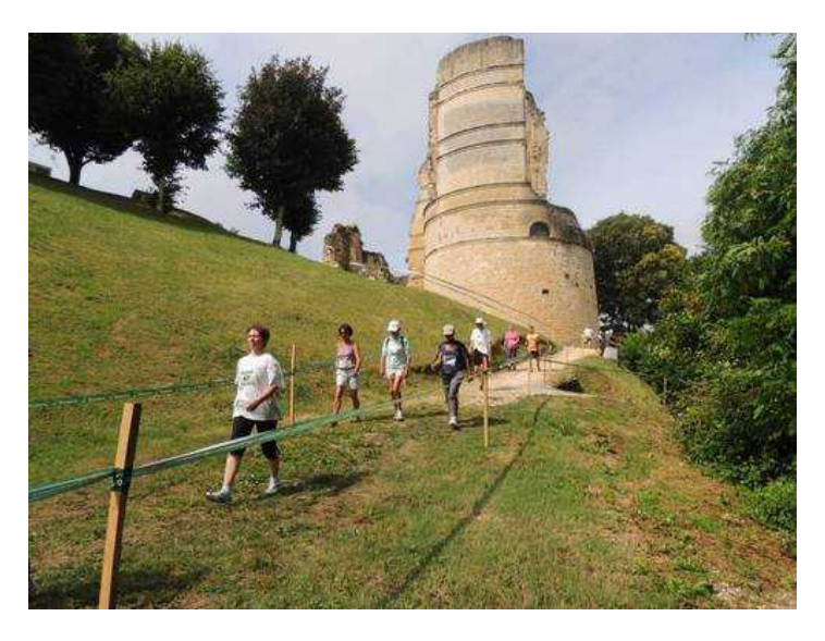
An ultra walk with a difference – up and down this steep hill each 2.2km lap, just to ad an extra layer of toughness