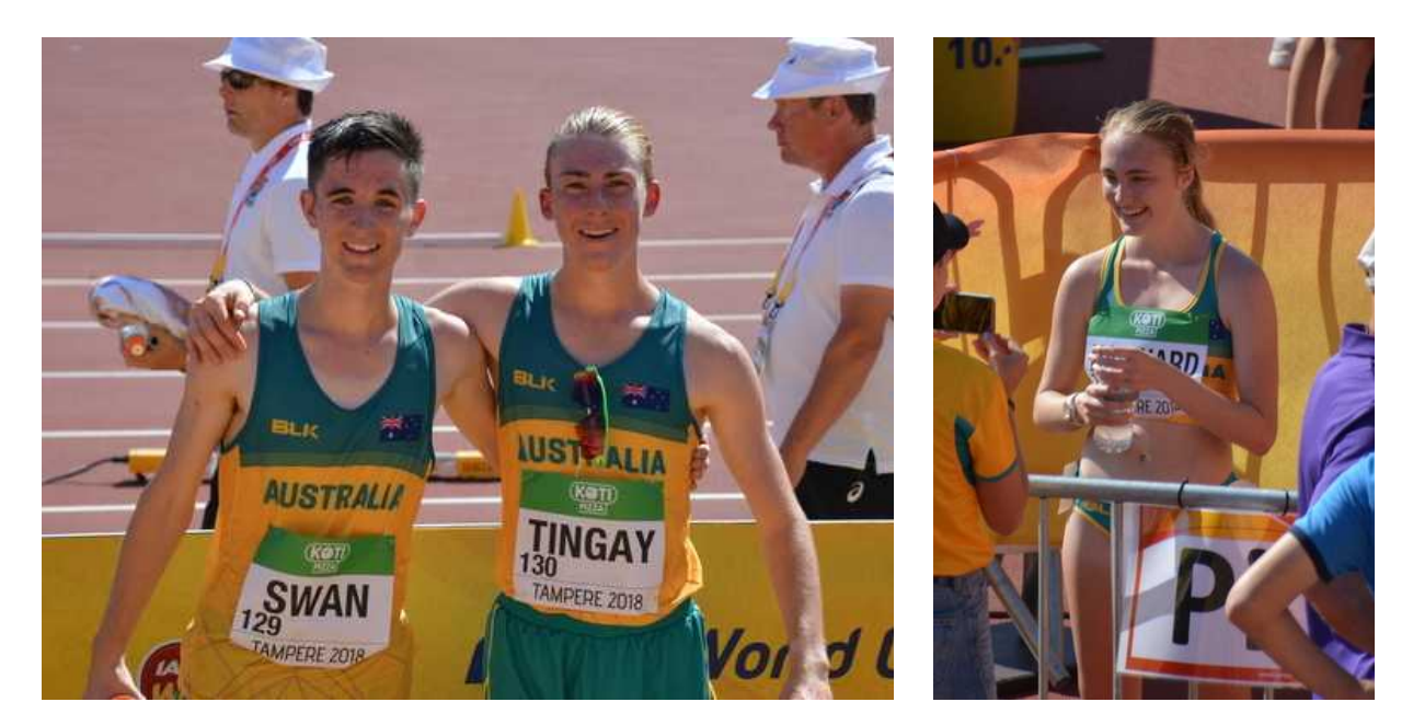
Three happy walkers after their excellent walks in Tampere

First to some links for Australian readers: