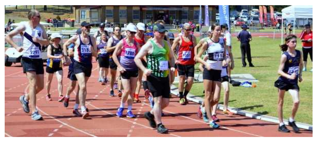
The 2000m walk gets underway at Aberfeldie on Saturday