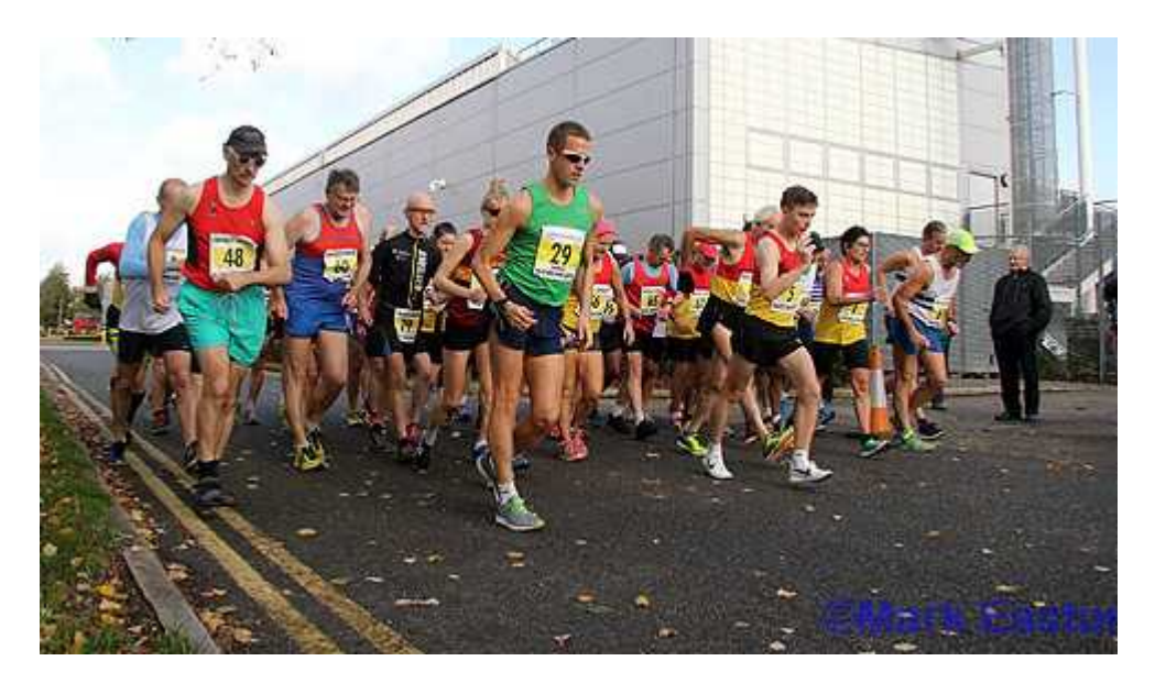
Walkers get underway in the Enfield 7 Miles Championship