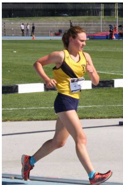
.....and walk mode