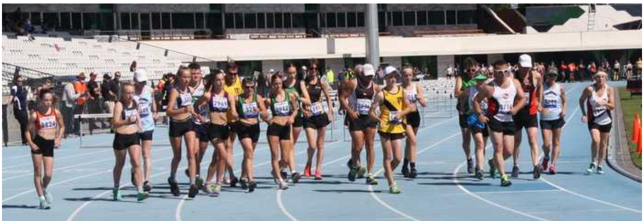
The start of the second heat in the AV Shield 2000m Walk