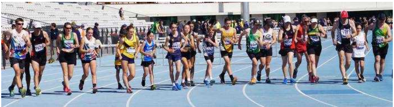
The start of the first heat in the AV Shield 2000m Walk