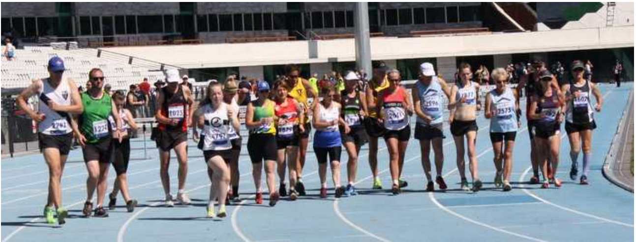
The start of the third heat in the AV Shield 2000m Walk