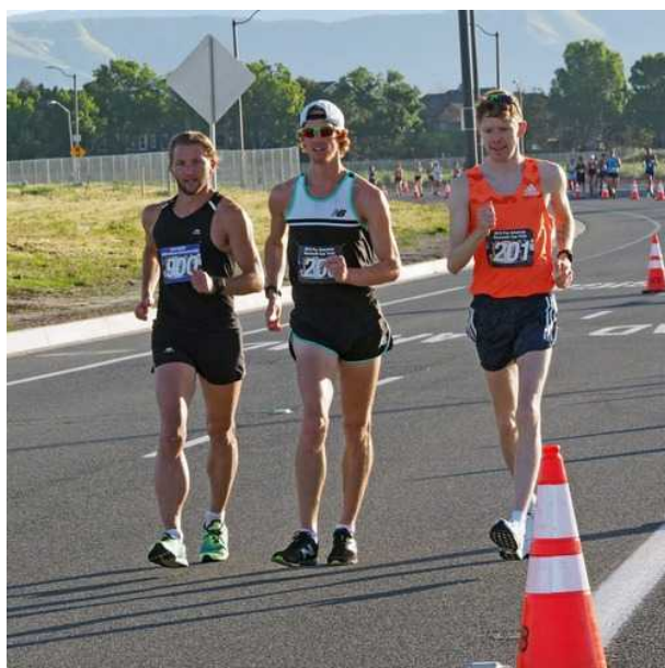
Nick Christie, Evan Dunfee and Tom Bosworth lead out in the USATF 20km last weekend