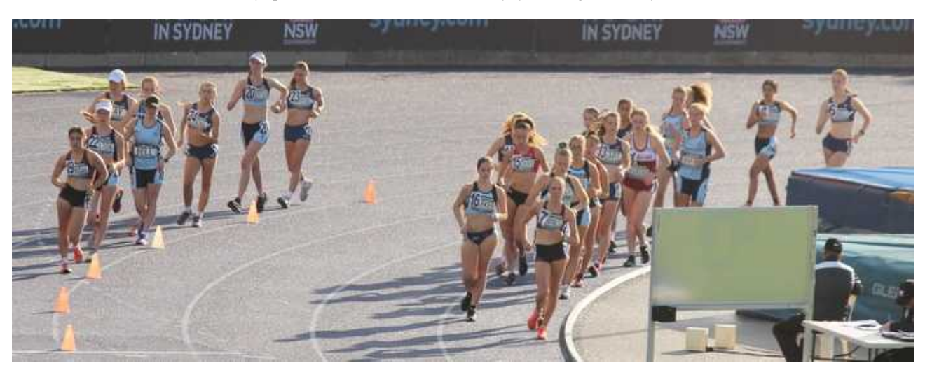
The start of the U17 and U18 Girls' 5000m Walks in Sydney