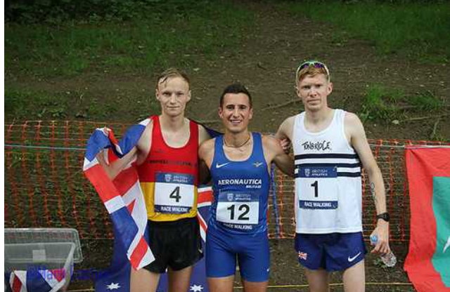
Podiums