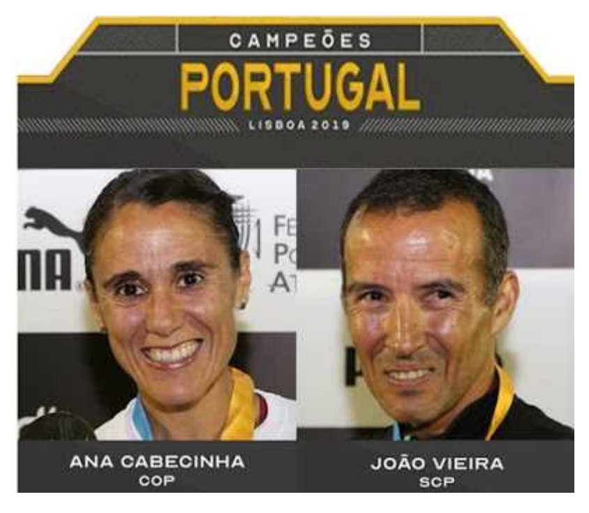
Portugal's 2019 track champions (Photos: Portuguese Athletics Federation, Editing: O Marchador)