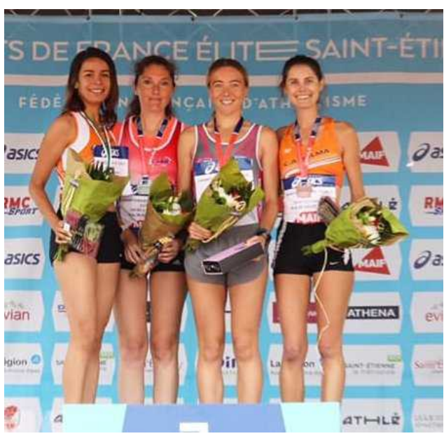
{\it The women's podium}