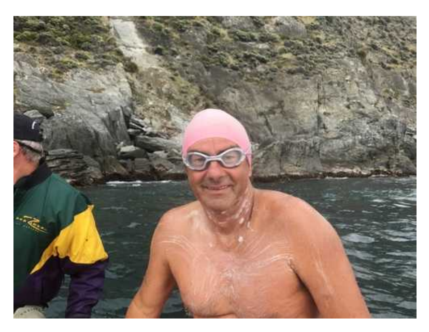
February 2017 – greased up and ready to swim the Cook Strait

Cook Strait is 26km in a straight line...although I covered a lot more distance thanks to the strong tide. The main challenge at Cook Strait is that it's such a volatile body of water and the tides only offer a very short window of opportunity to reach the finish.