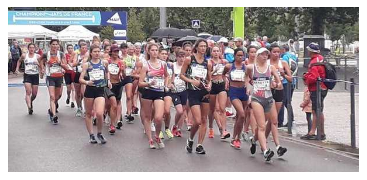
Start of the women's championship racewalk