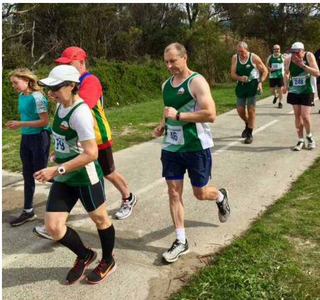
They're off and racing in Hobart