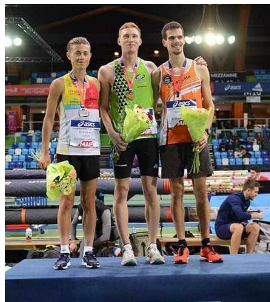
The two French Indoor Walk Championship podiums