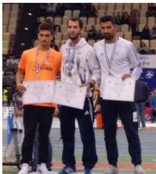
Men's and women's fields and podium placings